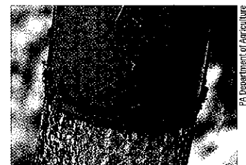
Figure 4. A banded tree with SLF nymphs stuck at the bottom.

Any tree can be banded, but we recommend specifically banding tree-of-heaven, the preferred host, or trees where you see a lot of egg masses or nymphs (Figure 4). Special tape for this purpose can be purchased, though duct tape wrapped backward and tight to the tree also works well. Push pins can be used to secure the band. Adult SLF will avoid tape, so it is essential to band trees in the spring when there are nymphs. Be advised that birds and small mammals stuck to the tape, while rare, have been reported. Check and change traps every other week.