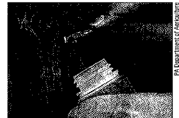
Figure 3. Scraping SLF egg masses from a tree.

This is the most effective way to kill the eggs, but they can also be smashed or burned. Remember that some eggs will be laid at the tops of trees and may not be possible to reach.